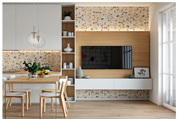
Table tops, cabinets, shelves, doors